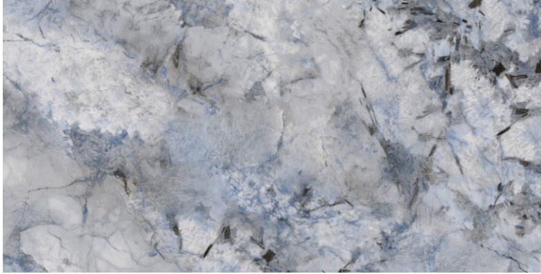
Patagonia Ice Soft Rettificato 60x120 cm

DOGMA® presents a new range of hygienic products DOGMA PROJECT ANTIBACTERIAL . The application of new technical glazes capable to stop the reproduction of bacteria guarantees antimicrobial protection to surfaces, ensuring a healthy environment, free of dirt and odor. The new technology applied to our ceramic tiles is ideal for all locations, especially with bacterial growth, such as kitchens, bars, restaurants, hotels, doctor's offices, schools, public offices, baths, SPAs and swimming pools. Ideal for personal and commercial use. DOGMA PROJECT ANTIBACTERIAL achieves the progressive elimination of bacteria by blocking growth, interrupting their life cycle.