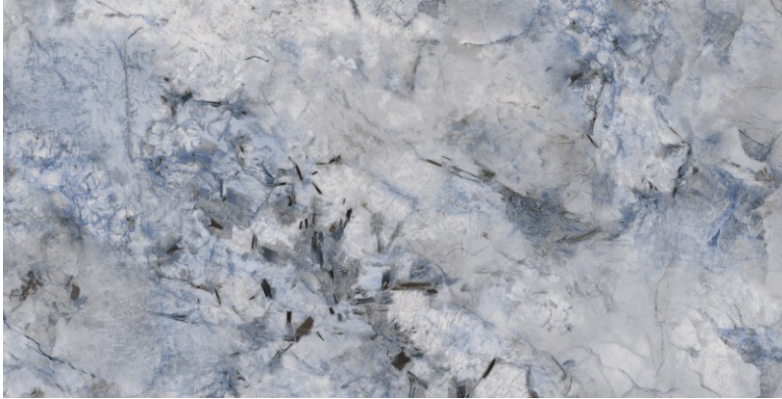
Patagonia Ice Levigato Rettificato 60x120 cm

DOGMA® presents a new range of hygienic products DOGMA PROJECT ANTIBACTERIAL . The application of new technical glazes capable to stop the reproduction of bacteria guarantees antimicrobial protection to surfaces, ensuring a healthy environment, free of dirt and odor. The new technology applied to our ceramic tiles is ideal for all locations, especially with bacterial growth, such as kitchens, bars, restaurants, hotels, doctor's offices, schools, public offices, baths, SPAs and swimming pools. Ideal for personal and commercial use. DOGMA PROJECT ANTIBACTERIAL achieves the progressive elimination of bacteria by blocking growth, interrupting their life cycle.